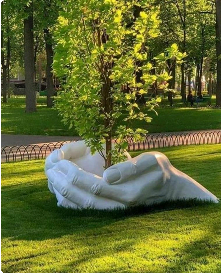
Resting time during this sadness and memories so beautiful.